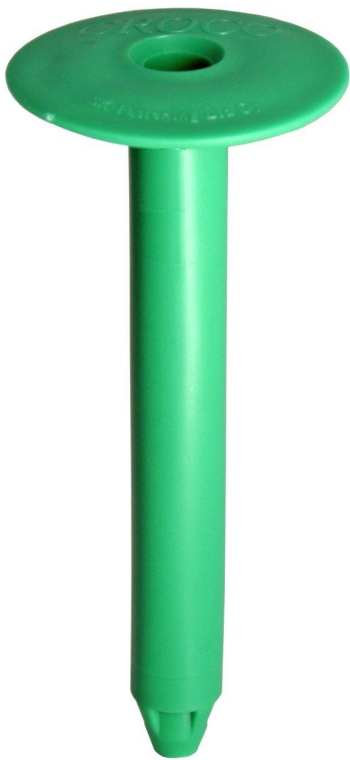
Picture 2. Croco B washer